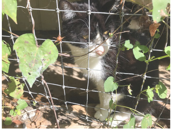
Previously feral Tom catches some rays in the cat run at Love-a-Paw. He is a very sweet older kitty.