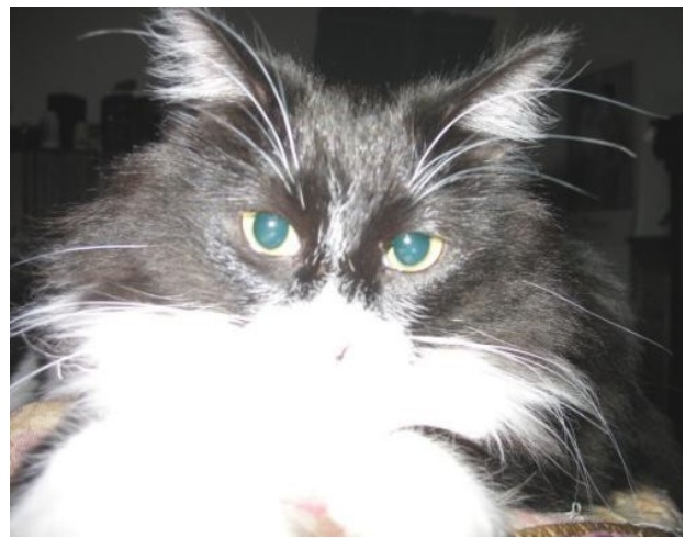
"This is a good hair day," says adoptable Sylvie.