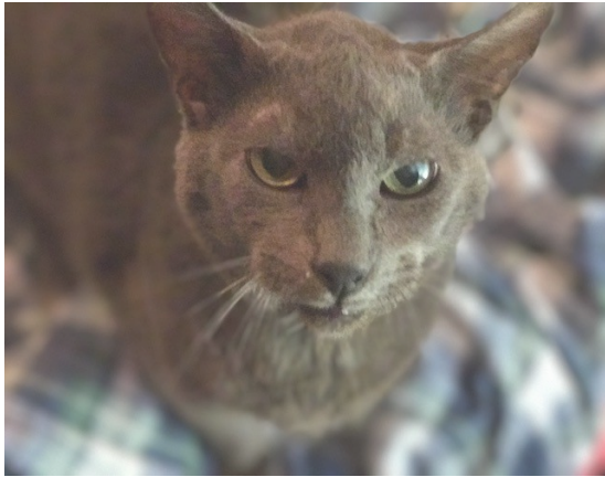
Jazzy was born in 2006. He is diabetic but well-regulated with insulin shots twice a day. He is very talkative and friendly. Jazzy is so precious. He will even jump up on the table to receive his insulin shots!